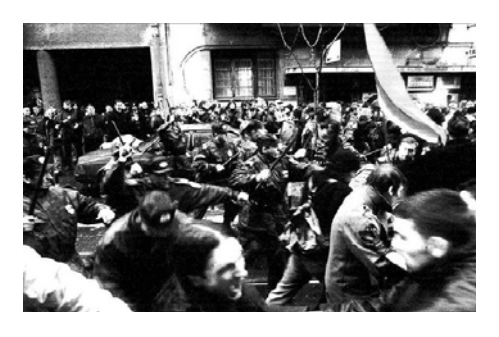
Police break up an Otpor! protest.

that room. A friend of mine was slapped in the face five or six times because he had asked a question (apparently they didn't like it, and they had all the power at that moment). It was