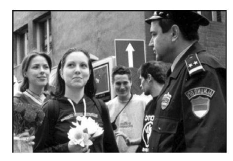
Otpor! activists face to face with the police.

Positive and hopeful thinking have always been key to Otpor!'s actions. This optimism and the conviction that change can really happen is exactly what repression tries to kill. By constantly preparing our activists, and supporting them when they were in trouble,