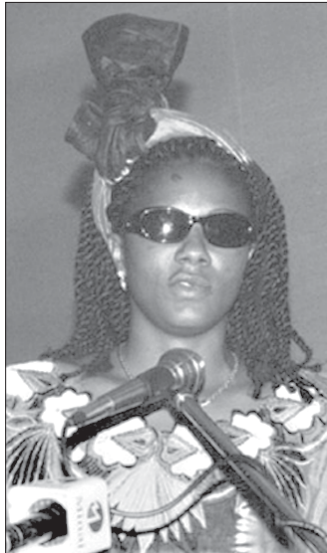
This woman chose to cover her eyes while testifying

A mock tribunal is a complicated endeavor, requiring significant organizational skills and good follow-through. You need to be sure that you have the resources and expertise to carry out each piece—the diplomacy of finding the judges, the savvy of attracting the media, the sensitivity to encourage the testifiers. Since the goal is a fairly large event, even the logistics will require significant commitment if they are to be done well.