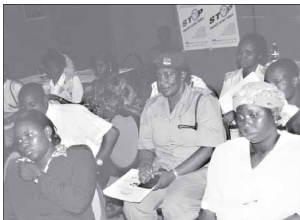
Participants and audience members