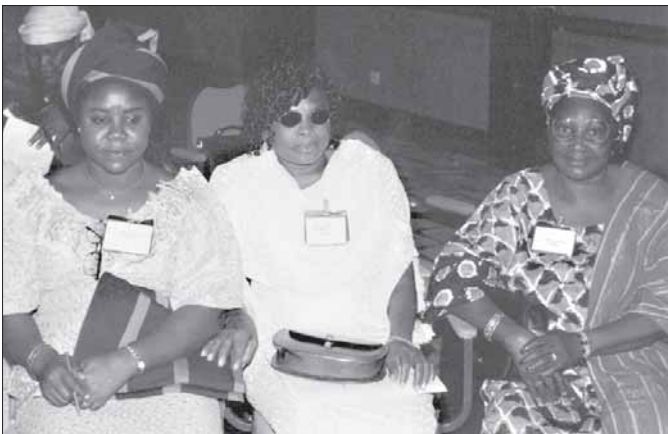
Women at the tribunal

Such taboos and silence around endemic human rights violations are widespread. Whenever they occur, the public system will tend to ignore its obligation to enforce human rights law; the media, usually dominated by elites, will promote the same silence; and activists will find themselves in need of creative tactics to break into the public consciousness and demand government action. The mock tribunal could, for example, be used to address HIV/AIDS issues. Those afflicted could testify on the ways HIV/AIDS is experienced, and the need