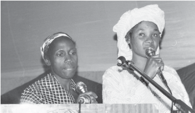
This young woman chose to speak without disguising her identity

organized for the media must carefully take into account the schedules and competing demands that journalists face.