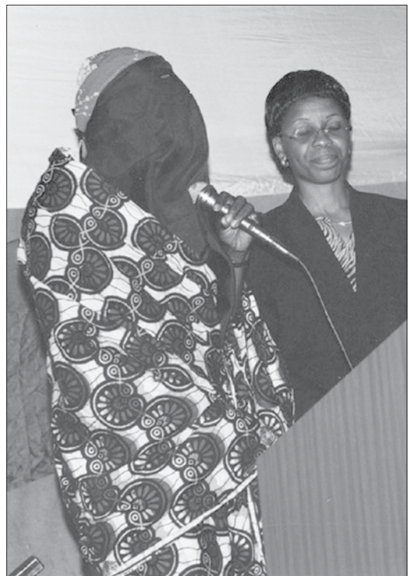
Some women chose to hide their identities while testifying. This woman covered herself completely.

Testimony at the tribunal moved witnesses to look anew at the problem of violence against women, and to demand action. A member of Nigeria's Upper House, Senator Khairat Gwadabe, told the testifiers "Although you are standing here before us, you are standing before the entire nation and the international society by standing on the podium to share your sufferings and the violence you have suffered as women," and added, "The tribunal is long overdue. I wish we could have this virtually every week for the next year. Nigeria would begin to see that the practices being perpetuated behind closed doors are not acceptable to the society." One of the lead facilitators insisted that "It is time for all women in Nigeria to stand up right now, fight tooth and nail to eradicate this menace." And another asserted that "The state should provide a code of conduct for operatives and defaulters should be openly and seriously punished. The crime against women should be seen and treated