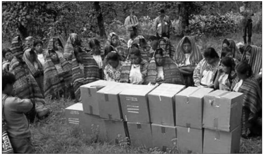
Families of the disappeared in Guatemala praying in front of boxes containing remains exhumed from a clandestine grave.

In every case, but especially in those where state agents are implicated in the crimes, it is essential to work with forensic specialists who are independent of the state. This guarantees the transparency of the process and builds confidence among families. This independence has two aspects. First, there should be no formal affiliation with the state. Second, the actual work of the investigation must be independent of political or other pressure that could result in biased results. For example, when a prisoner is found hanged in his cell in a jail, the official state doctor will usually perform the autopsy. While his work may be professionally sound, it will not be credible to the family because he is affiliated with the official system, and they will ask that a second autopsy be performed by someone from outside the state.