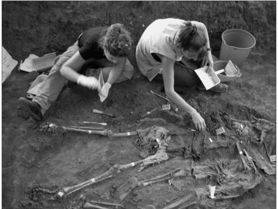
The archeological exhumation of a mass grave in El Salvador.

To achieve this certainty, the expert witness must have integrity and independence. He or she must be free of any pressure to draw a particular conclusion and not be dependent on either party to a dispute. Such independence is particularly important because often the official forensic experts are part of the very same state system that committed the violation.