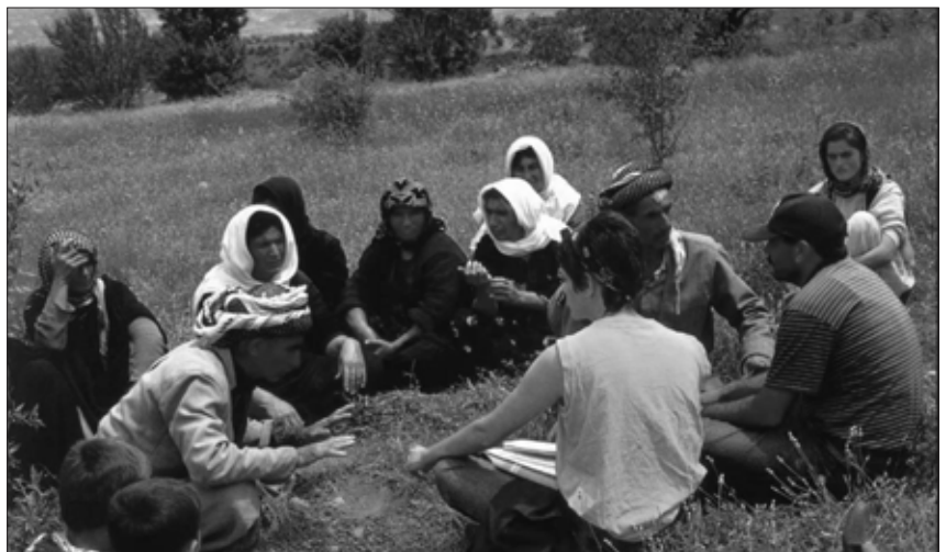
A member of the forensic team interviewing relatives in Iraqi Kurdistan.

In conclusion, human rights violations are not ordinary crimes, but extraordinary, massive and systemic violations, in which the state is often the main perpetrator. In many third world countries and fledgling democracies, political and executive powers can constrain the functioning of the judiciary, impeding the way that justice is investigated and administered. Thus there is always a risk that forensic analyses carried out by local professionals may be compromised.