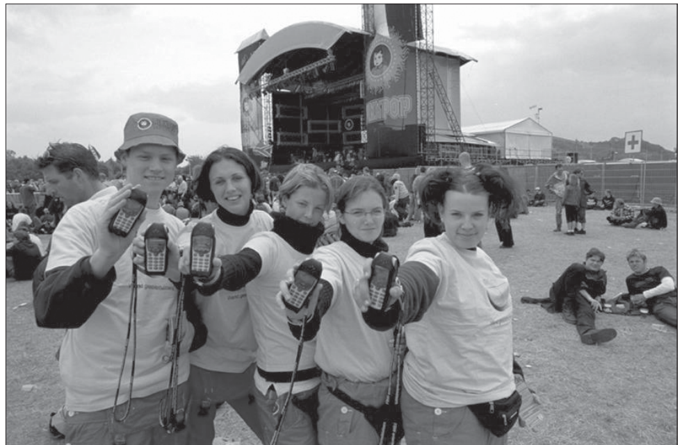
SMS campaign volunteers at a music festival.

We do have to make sure we don’t lose people’s enthusiasm and become an annoyance. Network members receive an urgent appeal every two weeks. This text is about a real person with a horrifying story, and we have learned from our users that no one thinks it is spam when they are touched by such a moving story and a chance to do something about it. But if members don’t react after three or four Urgent Actions, they will automatically receive a text message saying they won’t be a member anymore unless they voluntarily choose to continue. Often people send a message back to confirm that they are still interested.