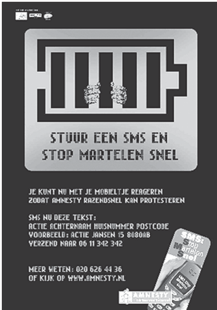
Poster for SMS campaign: "Send an SMS to stop torture fast."

an original idea and a good network of contacts. Amnesty is a well-known name in Holland with a general and uncontroversial appeal. Many people have friends or family who have done something with Amnesty, so it is not at all threatening. We took full advantage of this recognition in the sense that we were never hesitant to ask businesses to offer us services for free, knowing that they might think it was in their own interest to be associated with Amnesty's popularity.