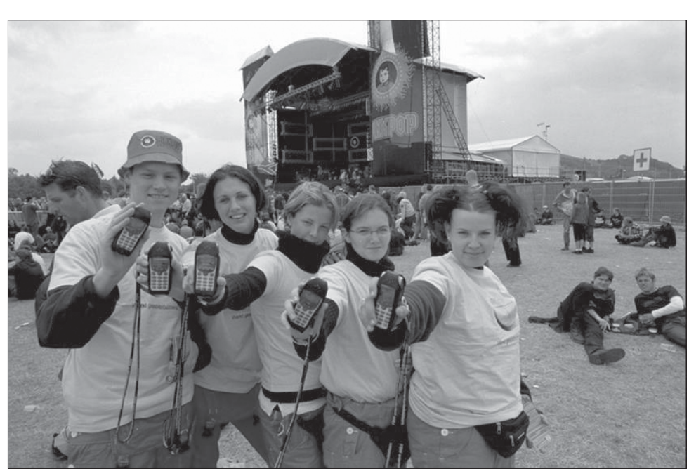
tactic is direct dialogue, asking SMS campaign volunteers at a music festival.

We do have to make sure we don't lose people's enthusiasm and become an annoyance. Network members receive an urgent appeal every two weeks. This text is about a real person with a horrifying story, and we have learned from our users that no one thinks it is spam when they are touched by such a moving story and a chance to do something about it. But if members don't react after three or four Urgent Actions, they will automatically receive a text message saying they won't be a member anymore unless they voluntarily choose to continue. Often people send a message back to confirm that they are still interested.