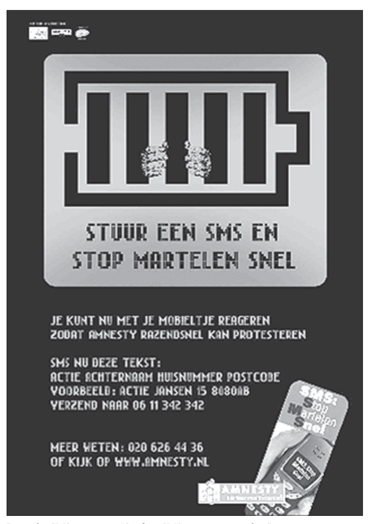
Poster for SMS campaign: "Send an SMS to stop torture fast."

an original idea and a good network of contacts. Amnesty is a well-known name in Holland with a general and uncontroversial appeal. Many people have friends or family who have done something with Amnesty, so it is not at all threatening. We took full advantage of this recognition in the sense that we were never hesitant to ask businesses to offer us services for free, knowing that they might think it was in their own interest to be associated with Amnesty's popularity.