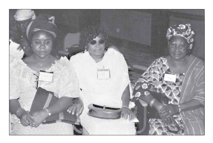
Women at the tribunal

It was, as mentioned above, difficult to obtain testifiers. For an event that will address the taboos and silence