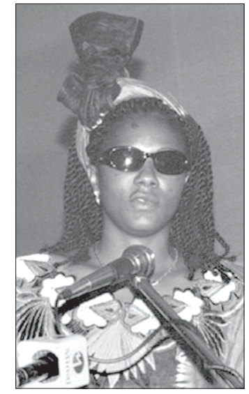
This woman chose to cover her eyes while testifying

A mock tribunal is a complicated endeavor, requiring significant organizational skills and good followthrough. You need to be sure that you have the resources and expertise to carry out each piece—the diplomacy of finding the judges, the savvy of attracting the media, the sensitivity to encourage the testifiers. Since the goal is a fairly large event, even the logistics will require significant commitment if they are to be done well.