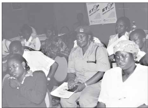
Participants and audience members