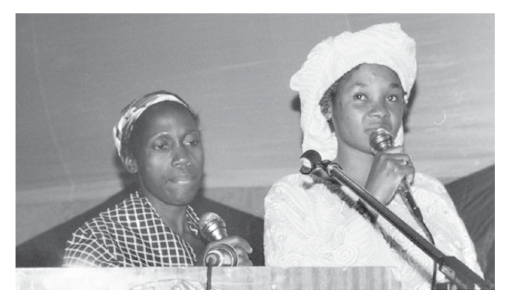
This young woman chose to speak without disguising her identity

organized for the media must carefully take into account the schedules and competing demands that journalists face.