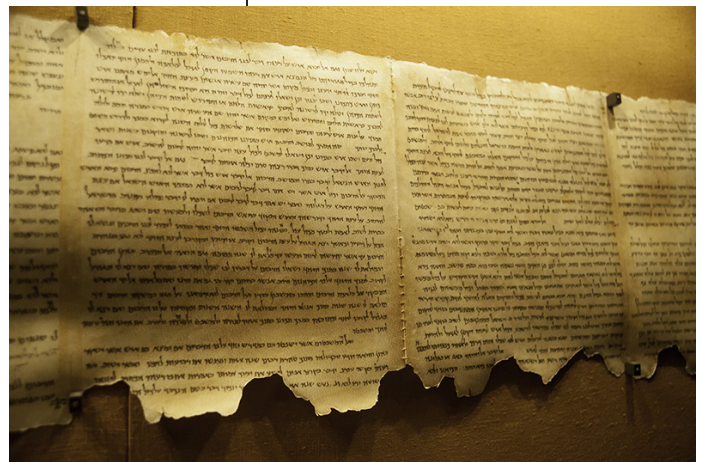
Figure 1: A picture of a segment of the Dead Sea Scrolls provided by Al Masir.

While local looters may start the chain of events, the stolen antiquities rarely enrich these local looters. This is because the artifacts move from looter to many middlemen, and finally, dealer to customer. For example, if you consider the profits based on 1 JOD. A local looter receives .500 JOD, a local middleman might obtain .750 JOD, an importer in another country would receive 2.500 JOD, and eventually a dealer making the sale to a customer collects 100 JOD. This kind of profit chain keeps people engaged in the illegal trading of antiquities. While the local looter clearly receives a pittance for the artifact, this short sighted illegal